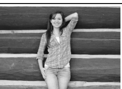
Horizontal photos do not fit our publishing specs. Also, only photos from the waist up are accepted or will be cropped.