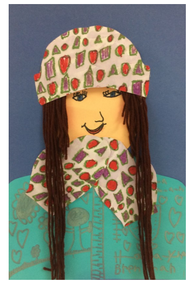
Halayna Winter Portrait

to throw our arms up and scream "Wheeee!" And slide down a hill happy as can be!